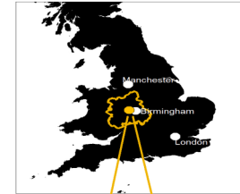
The Black Country